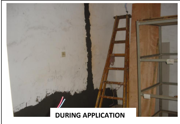
No.1 Sever Room

CASE STUDIES – SERVER ROOM No. 1, No. 2 & Control Centre Room (Dec 2012)